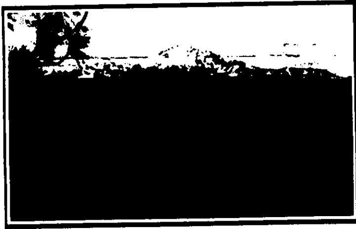
This is beautiful Lake Almanor